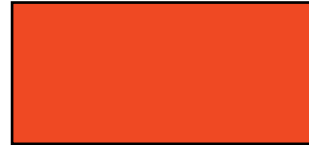
J.I. Case Flambeau Red 458