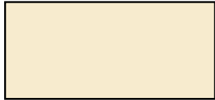
J.I. Case Power White 452