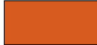
A.C. Persian Orange #2 478