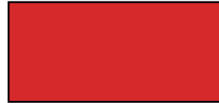
Ford Red (8N) 480