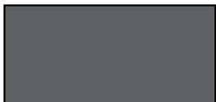
Ford Dark Gray (9N/2N) 475