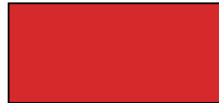
Massey Ferguson Red 467 (Safety Red)