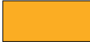
International Yellow 454