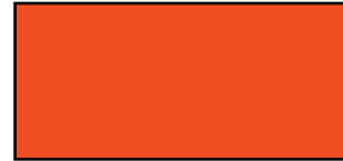
Kubota Orange #2 474