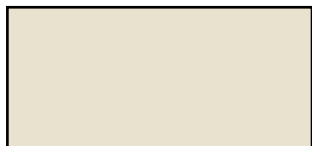
International Off-White 471