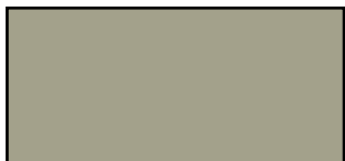
Ford Gray (8N) (Pre 1965) 457