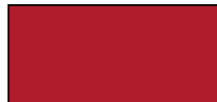
Case I.H. Red 455