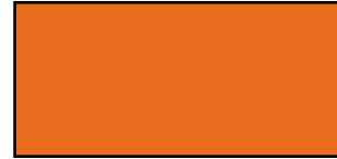
A.C. Persian Orange #1 477