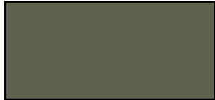
Ferguson Gray 476