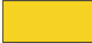
Ag Yellow (Safety Yellow) 450 (For Use on John Deere Equipment)