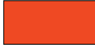
Ford Red-Orange (601/801 & Newer) 479