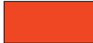
A.C. Orange (Safety Orange) 453